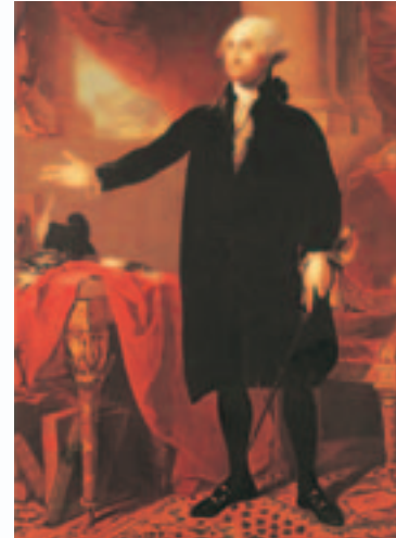
George Washington, the first president

Former Method of Election The Twelfth Amendment, added in 1804, changed the method of electing the president stated in Article II, Section 1, paragraph 3. The Twelfth Amendment requires that the electors cast separate ballots for president and vice president.