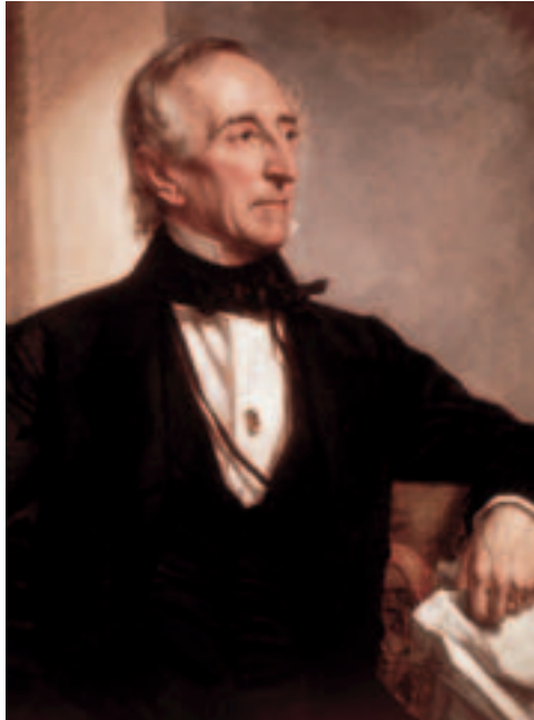
John Tyler was the first vice president to become president when a chief executive died.

Succession of President and Vice President This section provides that if the president-elect dies before taking office, the vice president-elect becomes president.