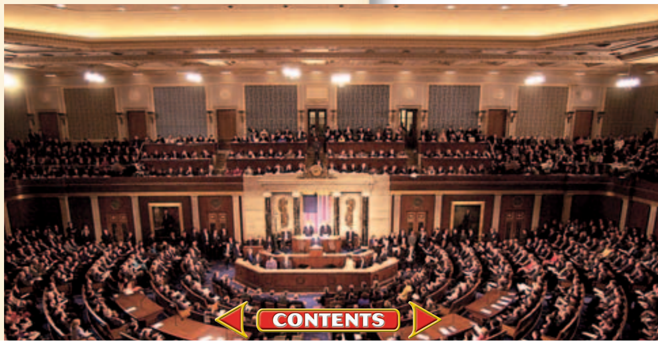
Joint meeting of Congress