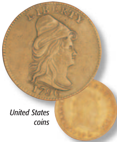
United States coins

Limitations on Power Section 10 lists limits on the states. These restrictions were designed, in part, to prevent an overlapping in functions and authority with the federal government.