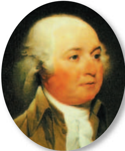
John Adams, the first vice president

Number of Members, Terms of Office, and Voting Procedure Originally, senators were chosen by the state legislators of their own states. The Seventeenth Amendment changed this, so that senators are now elected by the people. There are 100 senators, 2 from each state. The vice president serves as president of the Senate.