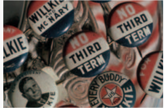
Presidential campaign buttons

Limit on Presidential Terms The Twenty-second Amendment (1951) limits presidents to a maximum of two elected terms. It was passed largely as a reaction to Franklin D. Roosevelt's election to four terms between 1933 and 1945.