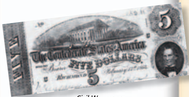
Civil War money

Expressed Powers Expressed powers are those powers directly stated in the Constitution. Most of the expressed powers of Congress are listed in Article I, Section 8. These powers are also called enumerated powers because they are numbered 1–18. Which clause gives Congress the power to declare war?