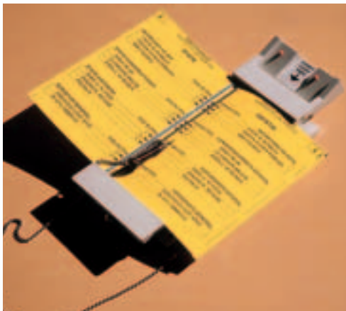
Ballot and ballot marker

Election of President and Vice President The Twelfth Amendment (1804) corrects a problem that had arisen in the method of electing the president and vice president. This amendment provides for the Electoral College to use separate ballots in voting for president and vice president. If no candidate receives a majority of the electoral votes, who elects the president?