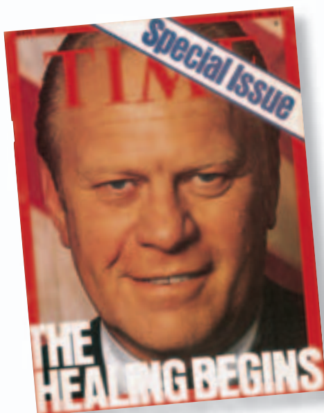
President Gerald Ford

This amendment was used in 1973, when Vice President Spiro Agnew resigned from office after being charged with accepting bribes. President Richard Nixon then appointed Gerald R. Ford as vice president in accordance with the provisions of the 25th Amendment. A year later, President Nixon resigned during the Watergate scandal and Ford became president. President Ford then had to fill the vice presidency, which he had left vacant upon assuming the presidency. He named Nelson A. Rockefeller as vice president. Thus individuals who had not been elected held both the presidency and the vice presidency. Whom does the president inform if he or she cannot carry out the duties of the office?