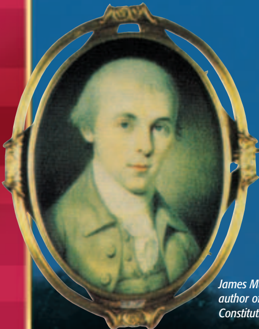
James Madison, author of the Constitution

The entire text of the Constitution and its amendments follows. Those passages that have been set aside, outdated by the passage of time, or changed by the adoption of amendments are printed in blue. Also included are explanatory notes that will help clarify the meaning of each article and section.